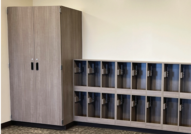
BENNETT RANCH ELEMENTARY Falcon, CO