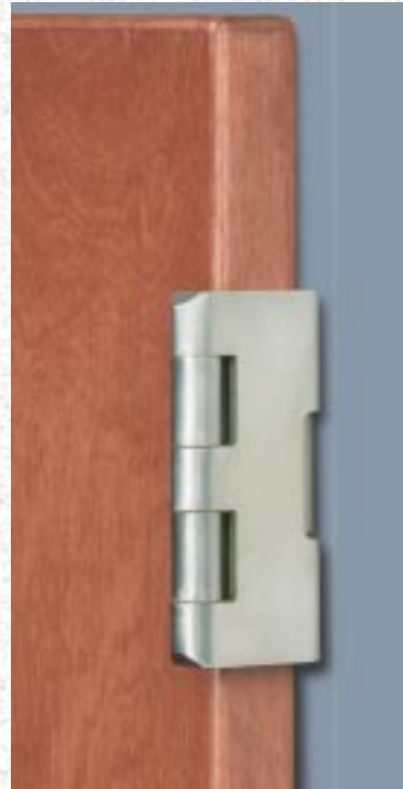
Wood finish veneer