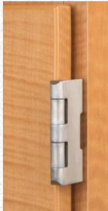
3mm radius edge