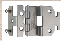
grey chrome SA101GC