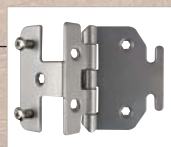
grey chrome SA121GC