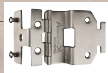
stainless steel SA103SS