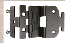
oil rubbed bronze SA101BR