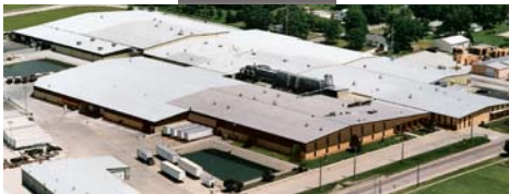
Stevens Industries, Inc. Teutopolis, IL