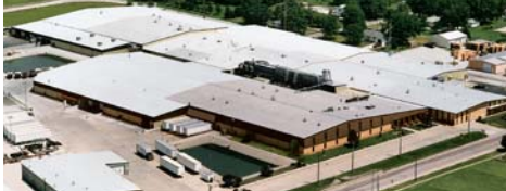
Stevens Industries, Inc. Teutopolis, IL