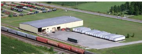
Stevens Rail Facility Teutopolis, IL