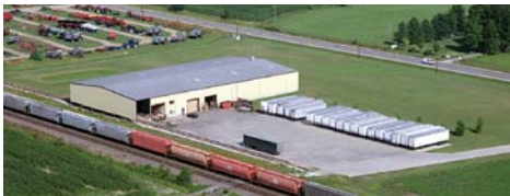
Stevens Rail Facility Teutopolis, IL