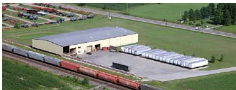
Stevens Rail Facility Teutopolis, IL