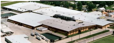
Stevens Industries, Inc. Teutopolis, IL