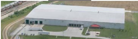
Stevens Avenue Facility Effingham, IL