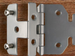
grey chrome SA121GC